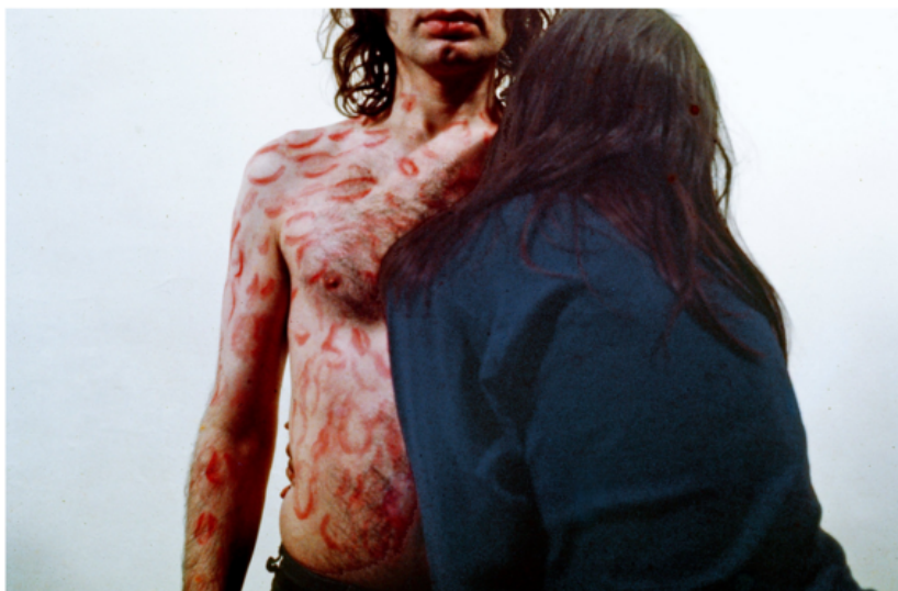
Vito Acconci's "Applications" from 1970.

Back in New York City after getting his degree, in the wastelands of the Lower East Side, the East Village and SoHo, Mr. Acconci began experimenting with using the city as another means of making literature.