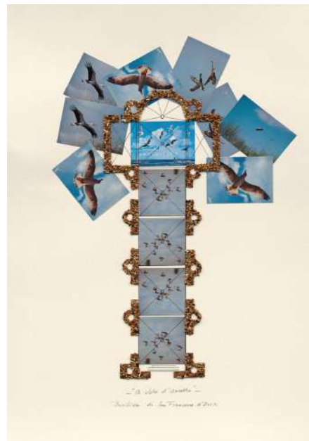
Marinus Boezem, A Volo d'Uccello , Basilica di San Francesco d'Assisi , 2010, Hahnemuehle Fine Art print, 109x79x4 cm. Edition 52/80.

Galleria Fumagalli re-presented the project A Volo d'Uccello in 2019 on the occasion of Marinus Boezem's exhibition Bird's-eye View , curated by Lorenzo Bruni. The gallery's main room hosted the ground plan of the Basilica of San Francesco d'Assisi, made of birdseed. Along with tree branches on the walls, the installation transformed the architectural interiors in a suggestive space where the categories of exterior and interior, culture and nature, history and memory, require to be reformulated.