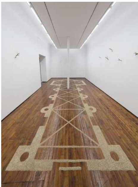
Installation view of Marinus Boezem, Bird's-eye View , Galleria Fumagalli, Milano, 2019.

The video A Volo d'Uccello is on view exclusively at this LINK typing the password: Volo